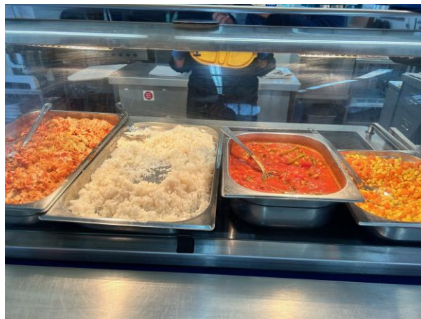
2 - Tuna pasta bake or Chunky Bean & Veggie Chilli with rice, both with vegetables.