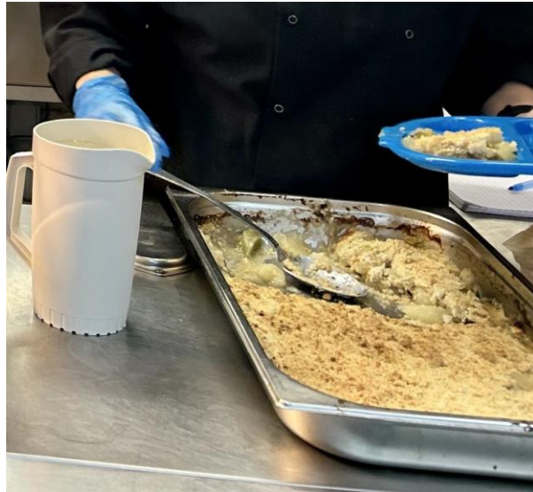
1 - Rhubarb and apple crumble with custard (or without).